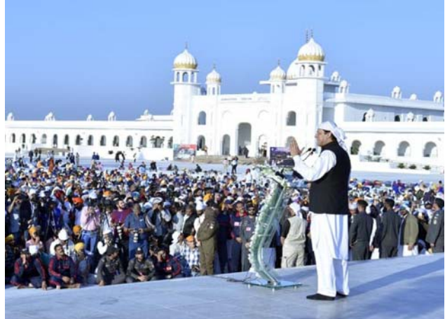
Prime Minister Imran Khan addressing at the inauguration Ceremony of Kartarpur Sahib Corridor at Kartarpur