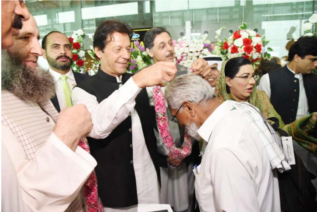
Prime Minister Imran Khan seeing off Hujjaj after inauguration of "Road to Makkah" program at Islamabad International Airport on 5th July, 2019

6. In pursuance of revised Air Services Agreement (ASA) executed in 2011 between Government of Pakistan and Kingdom of Saudi Arabia, hujjaj of the government scheme were airlifted by the designated airlines i.e. Pakistan International Airline (PIA), Saudi Airline and Air Blue.