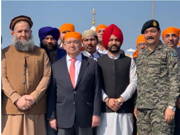
Pir Noor ul Haq Qadri, Federal Minister for Religious Affairs welcomes UN Secretary General Mr. Antonio Guterres at Karatarpur Sahib

67. In November 2018, Prime Minister Imran Khan announced and led the foundation stone of Kartar Corridor. The project was completed in a short span of time of one year. Inauguration ceremony was held on 09th November 2019. The gesture of Pakistan has been appreciated worldwide.