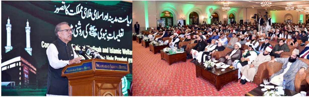
President Dr. Arif Alvi addressing the International Rehmat ulil Alimeen Conference in Islamabad on November 10, 2019.